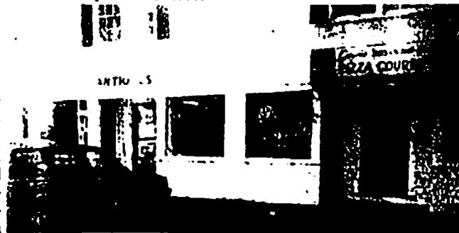
The Millbrook Post Office is now the Pizza Courier.